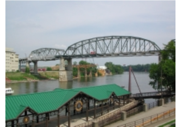
The Shelby Street Bridge viewed from Riverfront Park. (below)

designers considered painting it Columbia Blue to be consistent with bridges they designed in other areas.