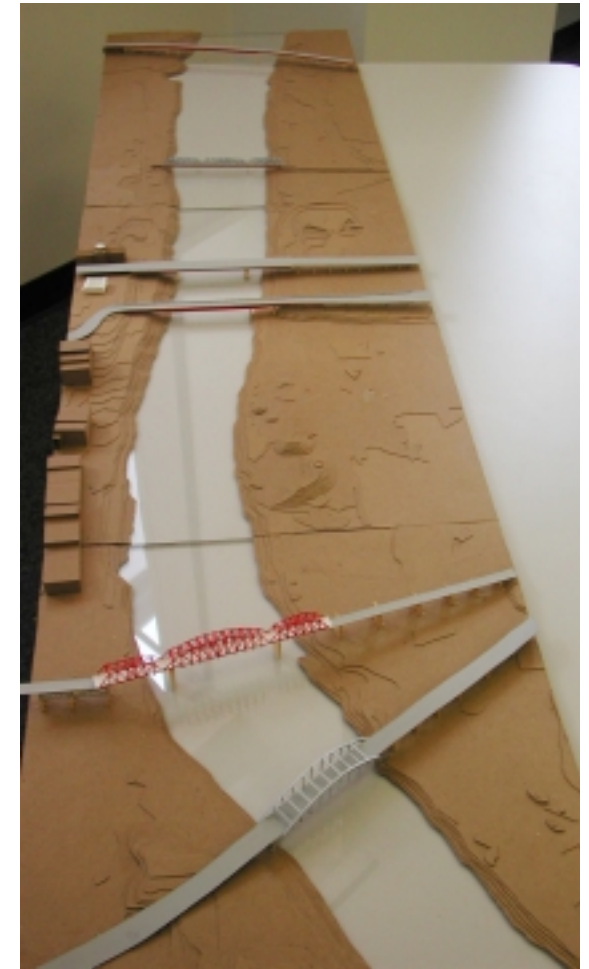
Model showing the bridges over the Cumberland River (below)

The shade of the color goes with the festivity of the carousel and the waterfront. Red is a great color to contrast the machine like qualities of bridges with the river and the proposed greenway. Red also projects a